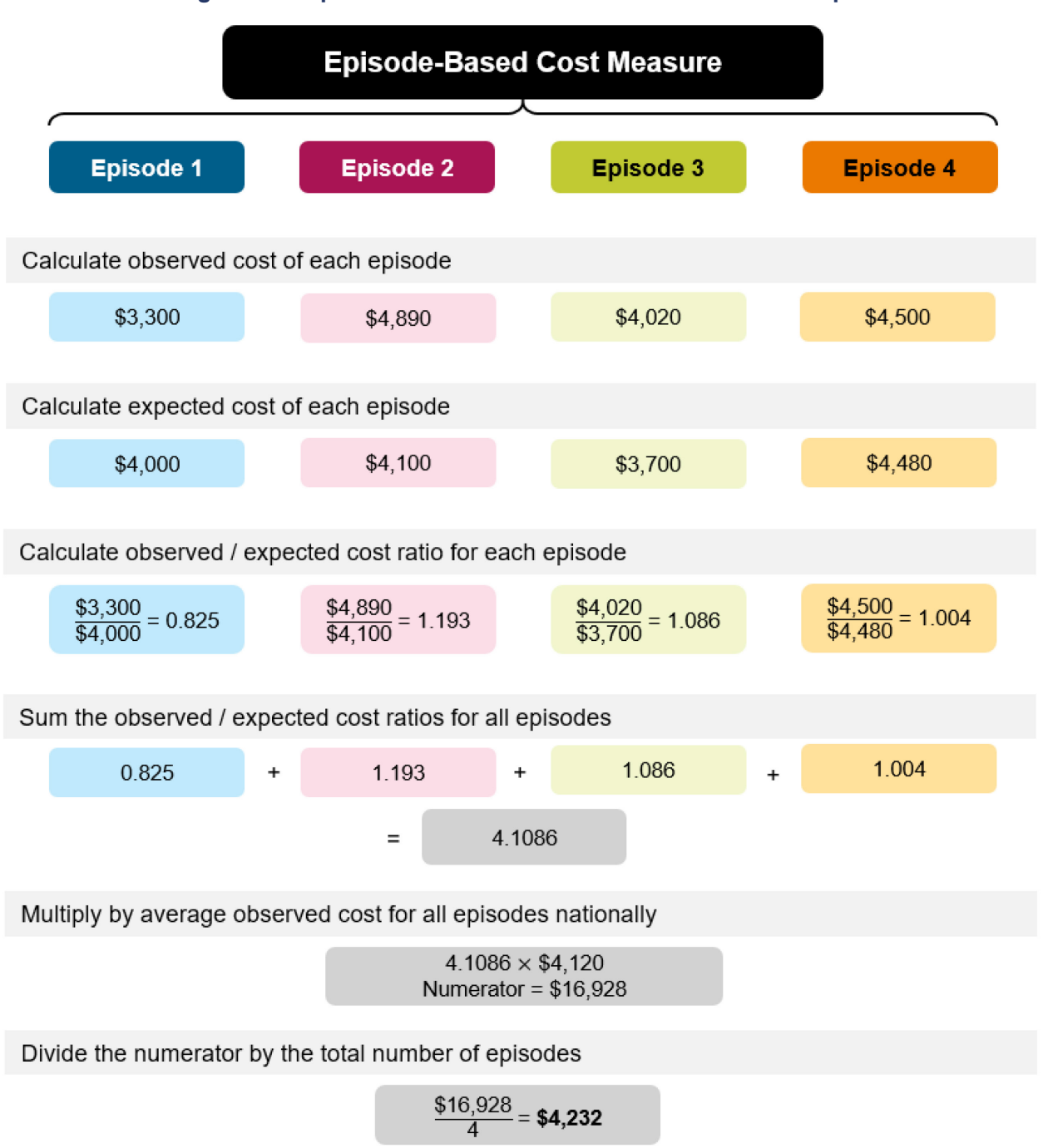
Figure B-1. Episode-Based Cost Measure Calculation Example

The diagram below provides an illustrated example of measure calculation, using an example measure where the clinician has only 4 attributed episodes for demonstration purposes. For more details on measure calculation, please refer to Section 4.6.